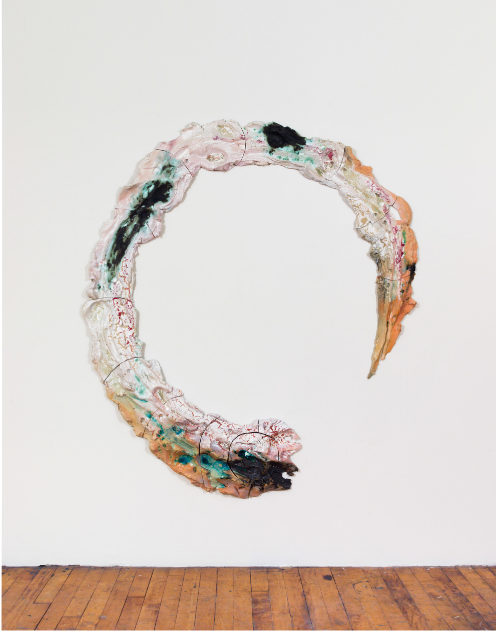
Brie Ruais, "Coming Back Around, 132 lbs," 2018.

"Attempting to Hold the Center, 135 lbs" is more fortress-like: a perimeter pushed out and up from an interior island. "Spreading out from Center Turning Left, 135 lbs (Widening Gyre)" resembles a starfish, its dynamically swirling limbs anchored by two distinct knee prints at its core.