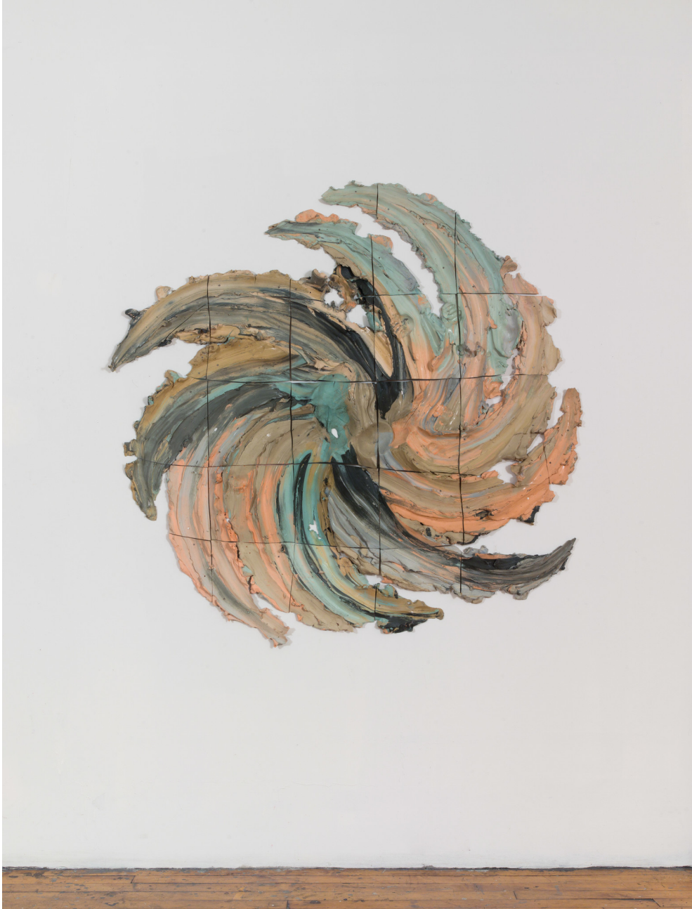
Brie Ruais, "Spreading Out From Center Turning Left, 135 lbs (Widening Gyre)," 2018.

Each work is a sculpture, certainly, but also documentation of a performance. Underscoring this relationship are two untitled works in unfired clay on the gallery floor: a gray spiral doubling back on itself in the center of the gallery, and a mass of red clay, shoved up against one side of the doorway. These pieces, which will change subtly over time as they dry, bring us into Ruais' process, a choreographed dance in clay.